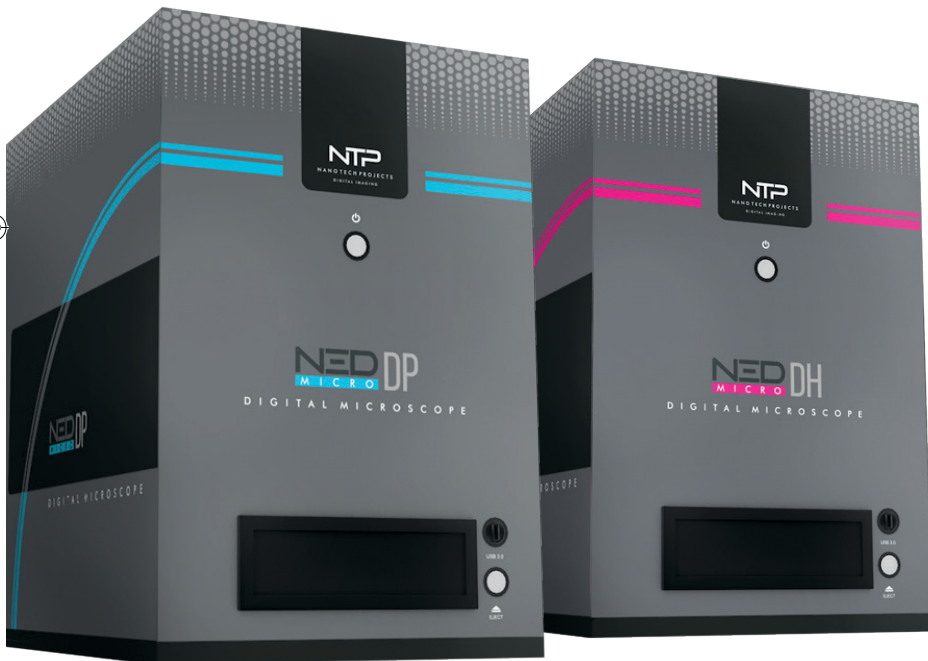
NED-DP for Digital Pathology